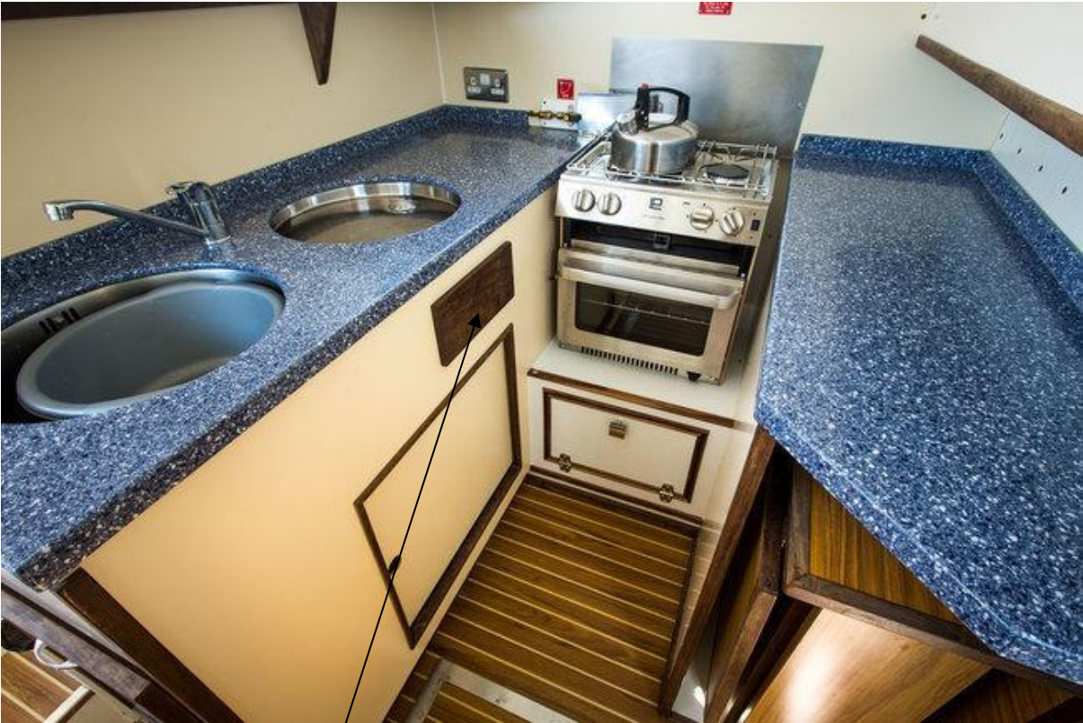
UTENSILS DRAWER - PULL TO OPEN